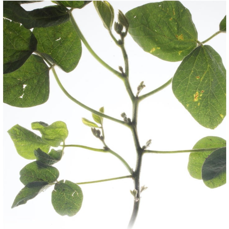
V5 Vegetative Stage Cotyledon Five open trifoliolates

Although the ideal is for leaf area and plant dry weight to continue to increase during this period without interruption, research has shown that loss in leaf area during this period typically has little or no effect on yield potential, if conditions are favorable to allow regrowth after the damage occurs. Leaf area loss due to hail or herbicide injury, or leaf area restrictions from lack of adequate water or herbicide, can all be made up if followed by a period of rapid growth.